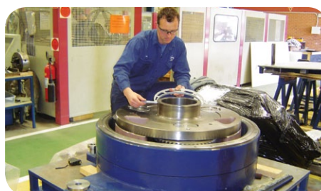
Inspection of Gearbox

The overhaul of these drives is of critical